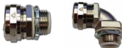
Straight and 90° - NPT Thread 3/8" through 2"